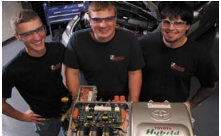
SCC Auto Tech students with new hybrid vehicle components the ins and outs of standard vehicles.

Bethurem says the current Hybrid Fundamentals class takes students through intensive training in hybrid-specific components and systems. Students enter the class in their last semester after learning