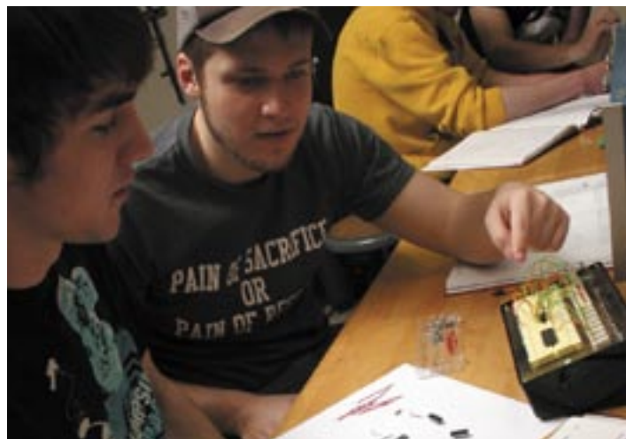
Electronics students study circuitry The Vision

The funds will become available to SCC beginning in July 2009. The levy will be in place until 2019.